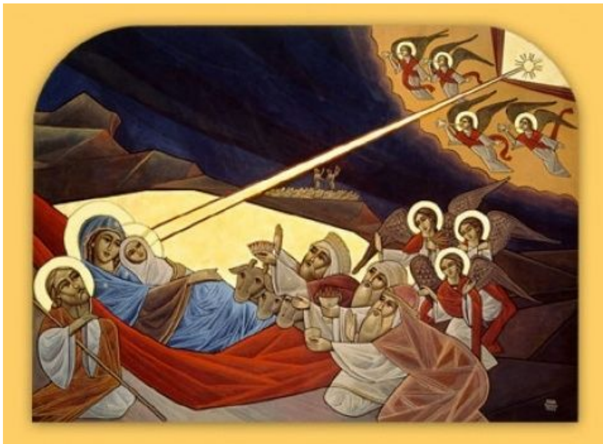
Coptic Icon of the Nativity of our Lord Jesus Christ

© Material from "A Reader's Guide to Orthodox Icons" has been adapted for this lesson http://iconreader.wordpress.com/2010/12/24/the-womb-and-the-tomb/